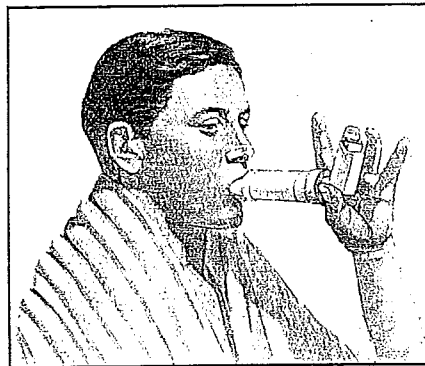
Using a spacer (holding chamber).