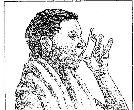
In the mouth.