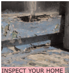
INSPECT YOUR HOME

PAINT Paint used before 1978 that is chipping or peeling may be a hazard. It is most risky at ages 9 months to 6 years when hand crawling and putting hands in mouth are most common. If you are