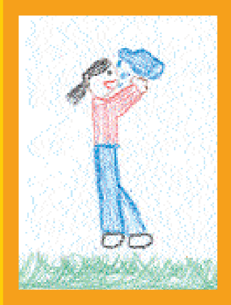
Illustrations by Boston Public School students.