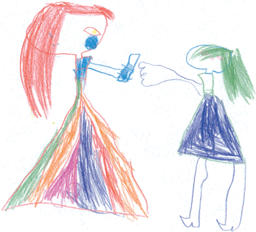
“A mother giving water to her daughter.”

To be healthy, it is important to choose healthy delicious drinks like water, low-fat milk, 100% fruit juice and homemade milk shakes, or bubbly drinks.